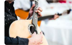
Exclusive Networking Experiences