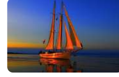
Sailing + Boating