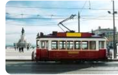
Full Day Tours